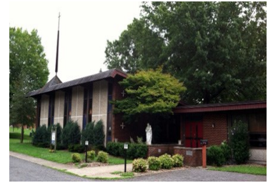
721 Hall Street Bridgeport