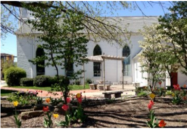
Sixth and Main Streets Clarksburg